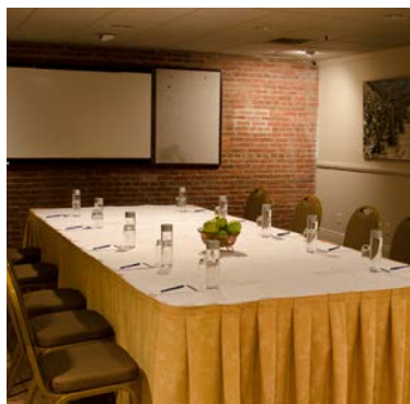
The Inn at Henderson's Wharf McClintock Room