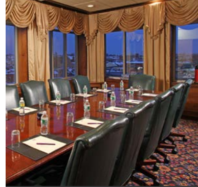
The Admiral Fell Inn Rooftop Captain's Boardroom