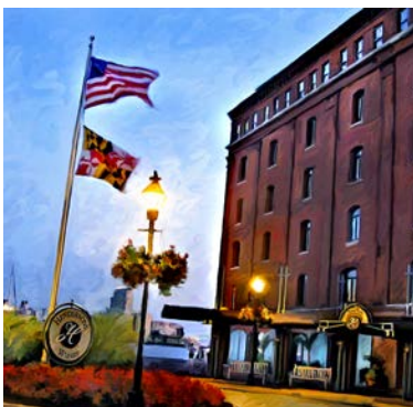
The Inn at Henderson's Wharf Fell's Point Hotel & Marina