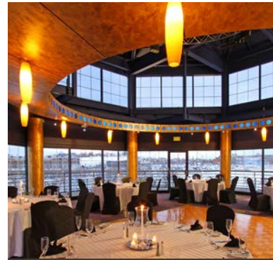
Pier 5 Hotel Waterfront Harbor Club