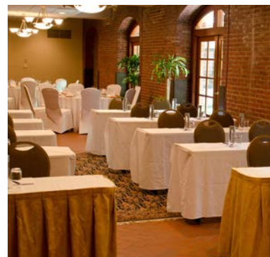
The Inn at Henderson's Wharf The Gallery