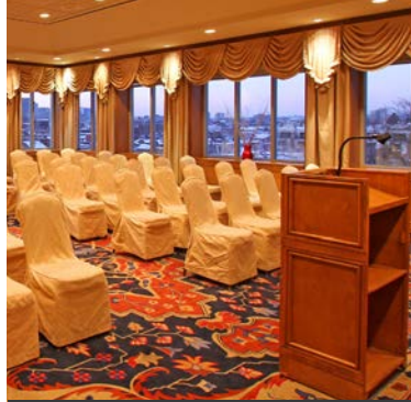
The Admiral Fell Inn Rooftop Admiral's Room