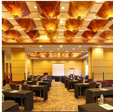
Pier 5 Hotel Harbor West Ballroom