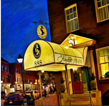
The Admiral Fell Inn Fell's Point Historic Hotel of America

web: www.HarborMagic.com blog: www.TravelGuideBaltimore.com www.Facebook.com/HarborMagicHotels